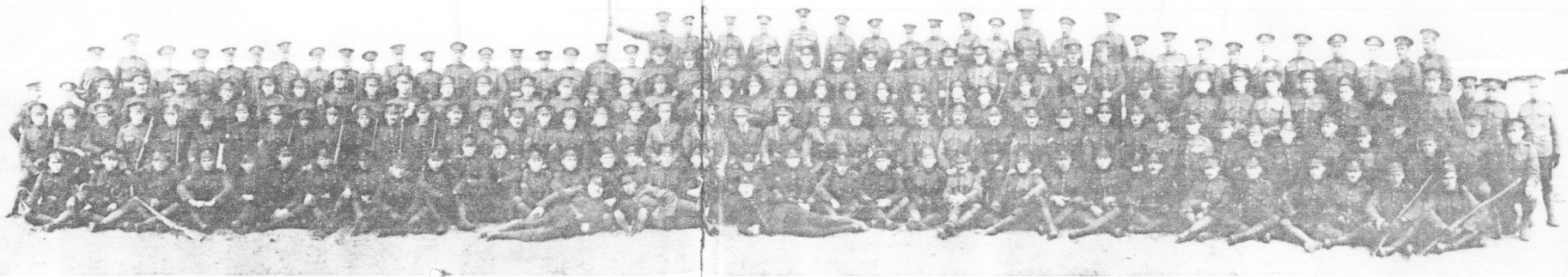
"C" Company, 157th, Overseas Battalion C.E.F. Simcoe Foresters, Camp Borden, October 10th, 1916.